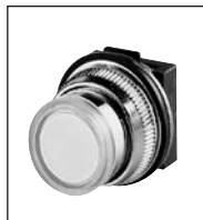
Operator Ø 30