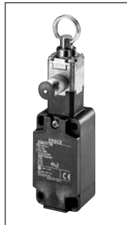
Plastic E100/E200/E300/ E400/E800 pull wire switches