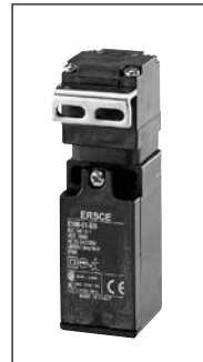
Plastic E100/E200/E300/ E400/E800 switches tongue actuated, 4-5 ways