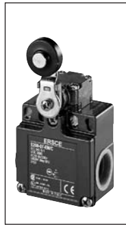
Plastic E100/E200/E300/E400 angular movement