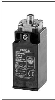
Plastic E100/E200/E300/E400 direct movement