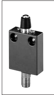
Direct movement with connector