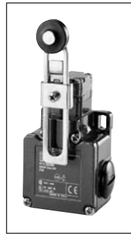
Metal E100/E200/E300/E400 angular movement