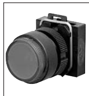
Operator Ø 22