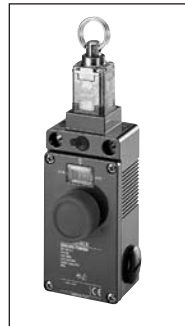
Metal E100/E200/E300/ E400/E800 pull wire switches