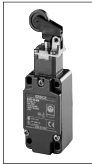
Metal E100/E200/E300/E400 direct movement