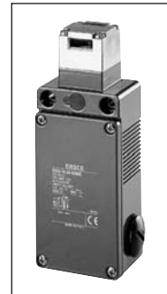
Metal E100/E200/E300/ E400/E800 switches tongue actuated, 4-5 ways