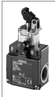
Metal E100/E200 switches with reset