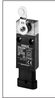
Angular movement with connector