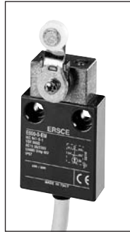
Angular movement with cable