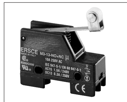
Roller lever actuator