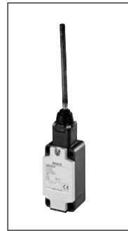
Plastic E100/E200/E300/E400 multidirectional movement