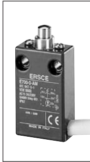
Direct movement with cable

Extremely compact E700-E600 series, with protection level IP67 against the entry of liquid and dust.