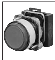
Operator Ø 22