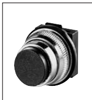
Operator Ø 30