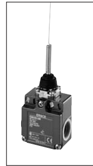
Metal E100/E200/E300/E400 multidirectional movement