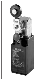
Plastic E100/E200 switches with reset